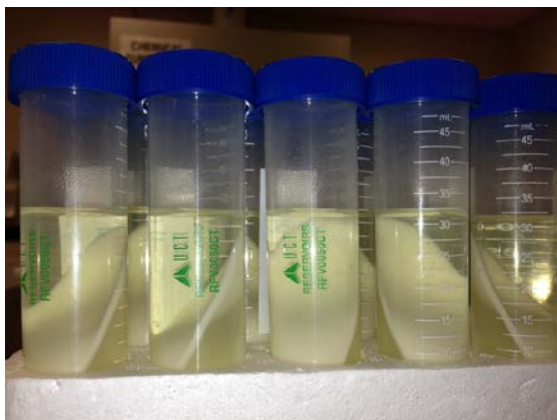
Whole Milk Samples Extracted by the AOAC QuEChERS Procedure