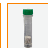
#2302-100AW2 Pre-filled 2 ml vial