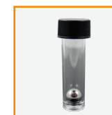
#2240-PC - Pre-filled 2 ml vial