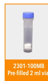
2301-100MB Pre-filled 2 ml vial