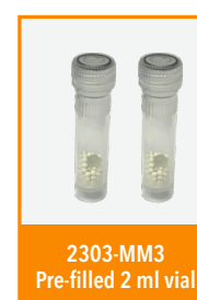
2303-MM3 Pre-filled 2 ml vial