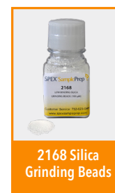
2168 Silica Grinding Beads

#2302-100AW - 100µm acid washed Zirconia beads