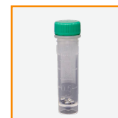
#2305-2800SS Pre-filled 2 ml vial