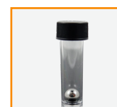
#2240-PC - 5 mL Polycarbonate Vial