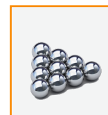
#2305-28 - 2.8mm stainless steel balls

Pre-filled Vials: #2302-3000AW, 3mm Zirconia; #2305-2800SS, 2.8mm stainless steel balls.