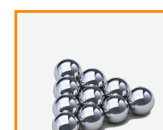
#2155 - 9.5mm stainless steel balls

(Consider Cryogenic options for 4ml & 15ml tubes)