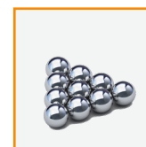
#2305-28 - 2.8mm stainless steel balls

Pre-filled Vials: #2240-PC 24 x 5ml polycarbonate vials preloaded with 9.5mm stainless steel ball; #2250, pre-cleaned polycarbonate, short form 15ml vial set, preloaded a 11mm stainless steel ball.