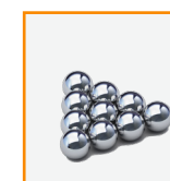
#2305-28 - 2.8mm stainless steel balls

Pre-filled Vials: #2302-100AW2, 100µm Zirconia; 400µm Zirconia; 800µm Zirconia