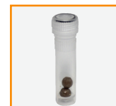
#2302-6000AW Pre-filled 2 ml vial