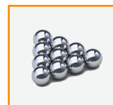
#2150 - 4mm stainless steel balls

(Consider Cryogenic options for 4ml & 15ml tubes)