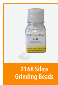
2168 Silica Grinding Beads

Pre-filled Vials - #2303-MM3 - Mixed 100µm, 1.4mm Zirconia & 4mm silica beads; #2302-1000AW - 1.0mm Zirconia beads