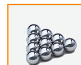
#2155 - 9.5mm stainless steel balls

(Consider Cryogenic options for 4ml & 15ml tubes)