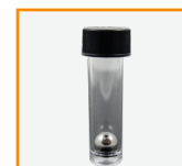
#2240-PC - 5 mL Polycarbonate Vial