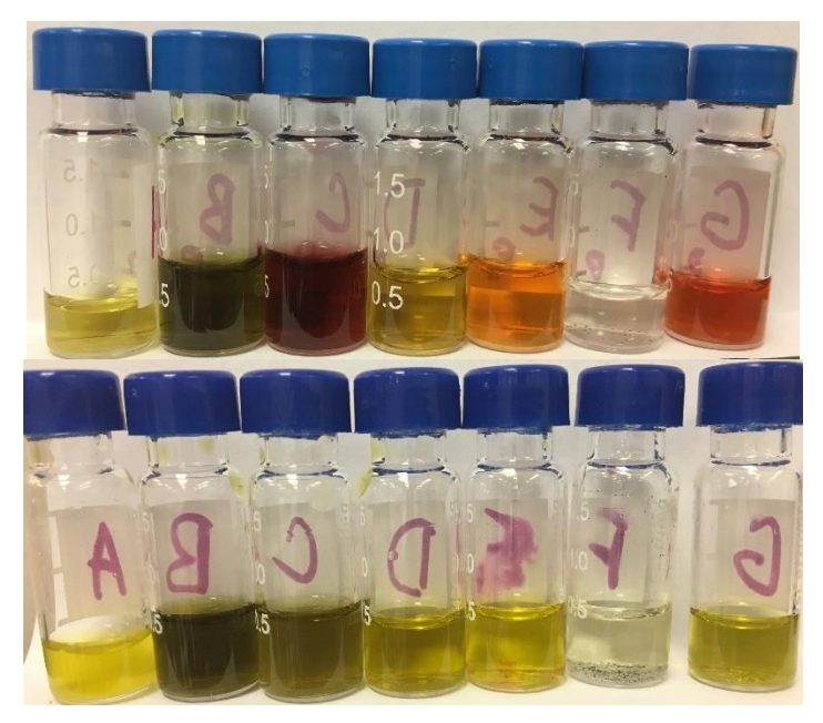
Figure 3. Extracts following various dSPE clean ups. Top: Grand Daddy Bottom: Tahoe OG

Note: The sorbent combination was 150mg MgSO<sub>4</sub>, 50mg PSA, 50mg C18, and either 50mg ChloroFiltr® or 7.5mg GCB. Significant variation in results are highlighted in red.