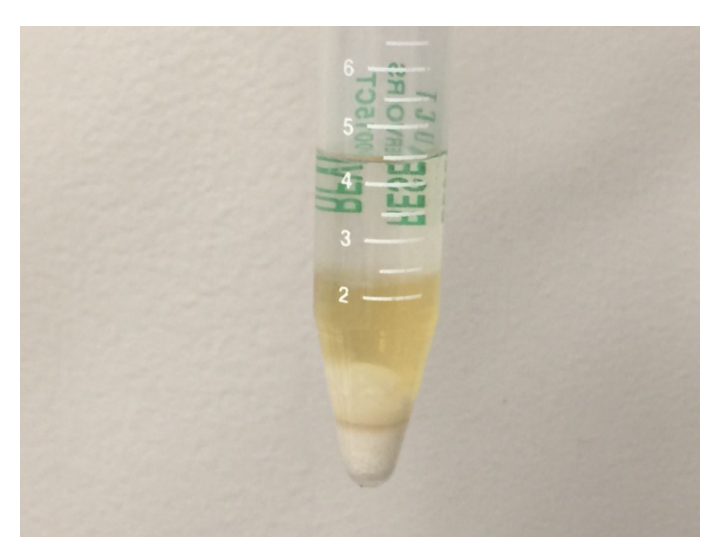
Figure 1. Sample after centrifugation THCA extracted into the upper clear layer