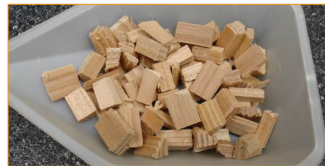
Wood sample before