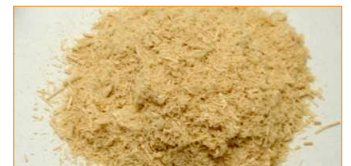
Wood sample after