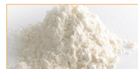
Spelt seeds after grinding